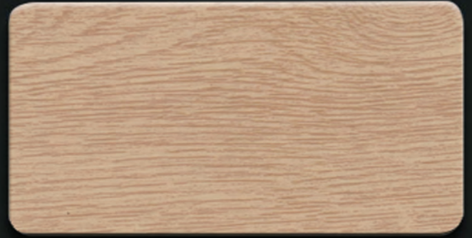
Pale Ivory Oak