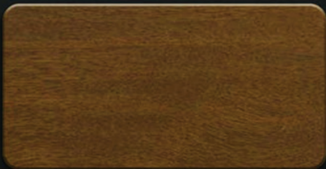
Golden Oak Light